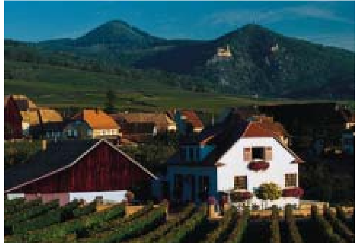
ORCHARD★STAR ...perfect for seeding in orchard, vineyard & berry rows.

ORCHARD★STAR is a versatile mix, equally useful in BC Interior and Coastal applications, for most permanent row crops such as grapes, currants, blueberries, ornamental trees and fruit orchards.